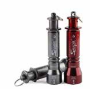
Product Code: 50-092-SN-02L-0192