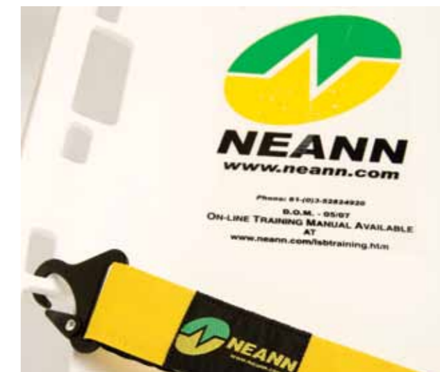
NEANN Long Spine Board (LSB)

Seeing a need for better Spine Board design and application, NEANN sought out the best Spine Board and Stretcher designs. The result is that we developed a new, lightweight and durable product that is now being used in every state in Australia.