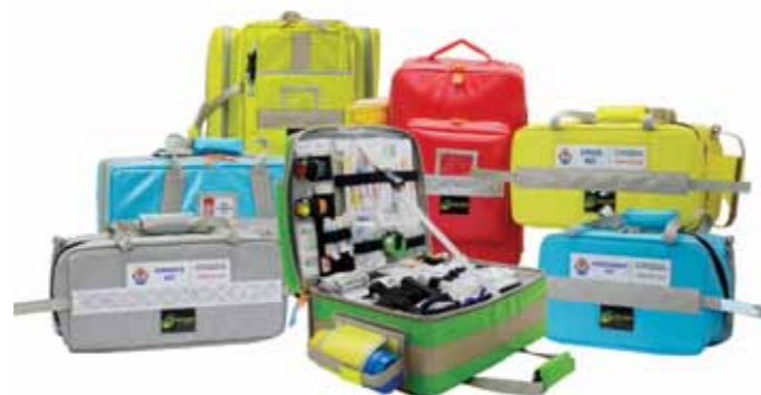
NEANN Medical Kits