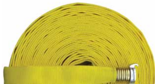
Myti-Flo Fire Hose